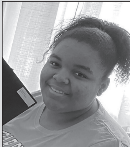
Trinity: Paul VI to Cedar Crest College