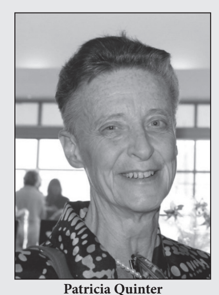
+July 18, 2023 Holy Name Principal 2009 – 2020

+Eternal Rest Grant unto them, Lord, and let perpetual light shine upon them.