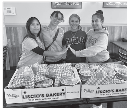
Working Together: A slice of New York Pizza and the Lambda Theta Alpha Sorority prepared and provided dinners for our North Camden families during the government shut down.

As a social service agency, we are committed to maintaining, strengthening, and reconciling the relationships